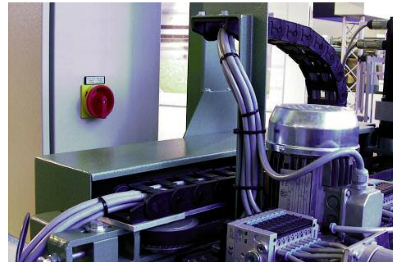
chainflex® CF140.UL for automatic feeder units. e-chain®: easychain®